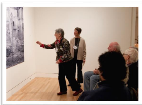
Frye Art Museum here:now program.